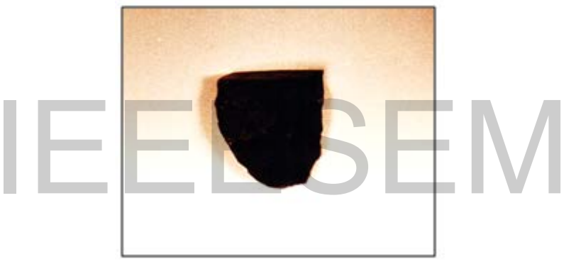
Figure 2. Roll fraction as test sample.

During the hot rolling process, the water mixture is cooled continuously with 2-2.5% soluble oil. Dissolved oil temperature \pm 40 0C and pressure 6 kg / mm2, which are used to cool and lubricate the roller surface. After the rollers are used for hot-rolling copper rods, the hardness distribution is uneven, from the specified hardness of 50-52 HRc to 45 HRc, increasing to 55 HRc The rollers used for breakage after heat treatment are tested in the laboratory to determine the cause of the roller surface damage.