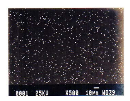
Figure 3.Copper penetration on the roller surface (raised 500 X)

On the surface of the roller in direct contact with hot copper, copper spots are visible on the surface of the roller.