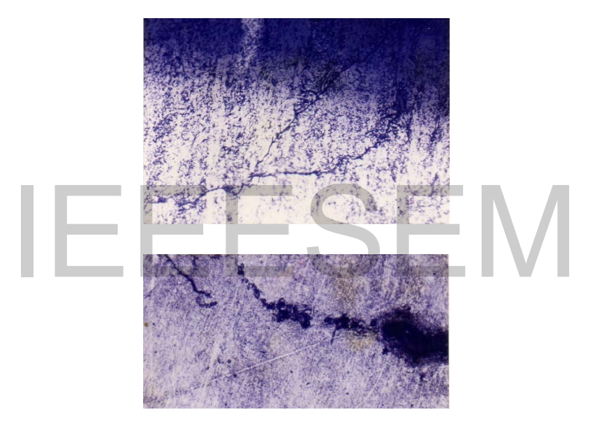
Figure 5. Cracks in the roller surface

Through SEM testing on the roller surface it was found that the soft cracks spread over the entire surface, starting from the shape of the cracks, including the type of thermal fatigue. Small cracks in the roller surface take longer to propagate because the damaged roller is used continuously.