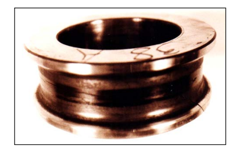
Figure 1. Rollers for reducing hot copper

During the hot rolling process, the water mixture is cooled continuously with 2-2.5% soluble oil. Dissolved oil temperature \pm 40 0C and pressure 6 kg / mm2, which are used to cool and lubricate the roller surface. After the rollers are used for hot-rolling copper rods, the hardness distribution is uneven, from the specified hardness of 50-52 HRc to 45 HRc, increasing to 55 HRc The rollers used for breakage after heat treatment are tested in the laboratory to determine the cause of the roller surface damage.