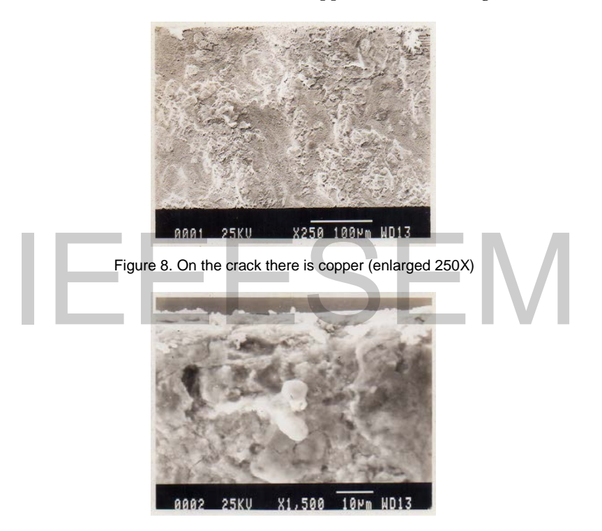
Figure 9. In the roller material there is copper (enlarged 500X)

Since the direction of the crack may be on the right or left, penetration of the copper will result in a copper layer at the bottom of the small hole in the surface of the roll, which will cause the stress applied to the winding material to become unstable.