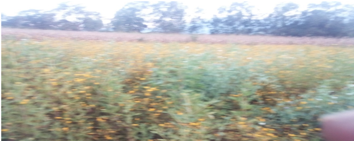
Figure 2: Honey bee flora in Jimma Horro district

seasons. They also indicated that bee forage was found to be declining as compared with the past period due to deforestation and expansion of cultivated lands in the area.